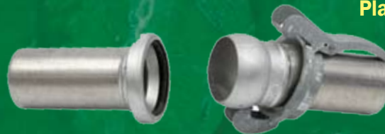
Bauer Style Ball & Socket